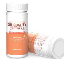
OIL TEST STRIPS