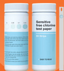
CHLORINE TEST (LR)