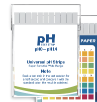
PH 0-14 TEST STRIPS