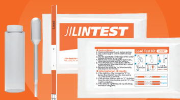
LEAD TEST KIT