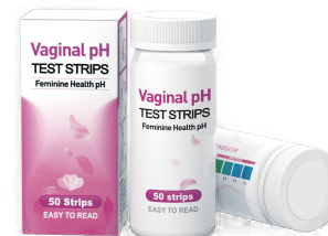
FEMALE TEST STRIPS