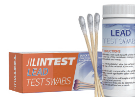
LEAD TEST SWABS