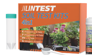
SOIL TEST KIT 4IN1