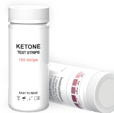
KETONE TEST STRIPS